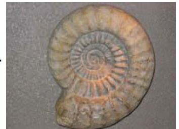
An ammonite fossil